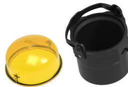
SK 11.10 Hanger with cup cup bio-safe 4883