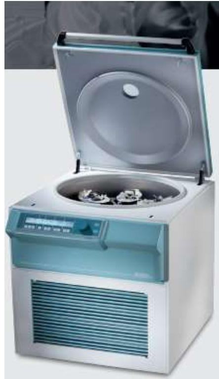
Roto Silenta 630 RS

The following rotors of the centrifuge from Hettich are compatible for both TubeSpin® Bioreactor 450 and 600