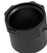
4895 Hanger without closure use with adapter

For more technical information on centrifuges, rotors and adapters from Andreas Hettich GmbH & Co KG please visit www.hettichlab.com and/or contact info@hettichlab.com .